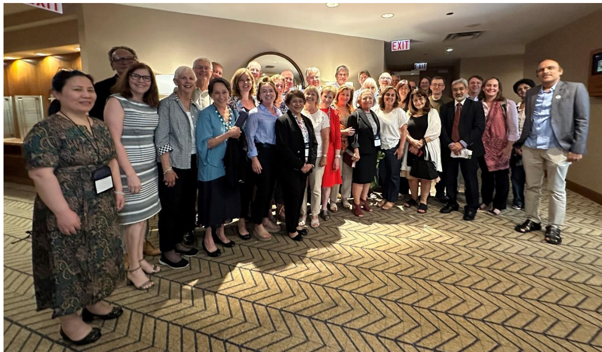
IUSTI World ExCo members, Chicago, July 2023